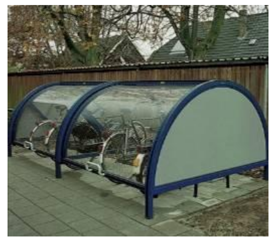
A bicycle drum