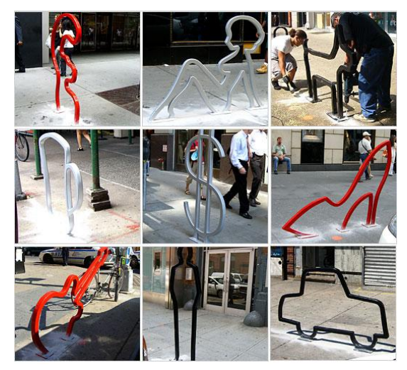
Bicycle stands as design objects, but still solid, robust and secure (David Byrne, New York)