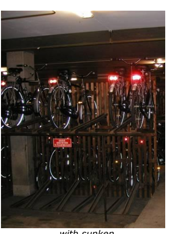
...with sunken lower tier