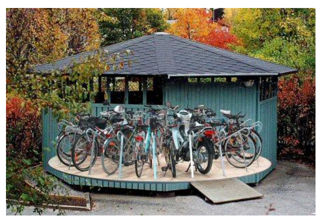
Carousel cycle locker: bicycles are on hand-rotated platform that moves your bicycle in front of the single-door entrance (Sweden, see clip on <a href="https://www.plug.se">www.plug.se</a>)