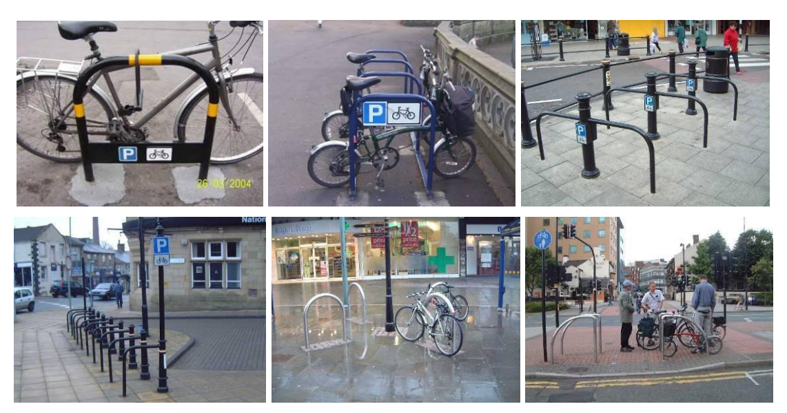
Inverted U-shaped bar stands, with design variations (UK)

In view of these requirements, it is not surprising that the inverted U-shaped bar is widely recommended . The height is between 0.7 m and 0.8 m. The bicycle frame leans against it and the frame and a wheel can be attached with a single lock. It is easy to use and suitable for all types of bicycle. It's a simple, low-tech and robust design that makes it easy to install and difficult to vandalize. It is inexpensive and requires minimal maintenance. An extra horizontal bar is useful to support smaller bicycles. Moreover, any number of them can be simply aligned and provided with a roof for covering. It also allows for design variations to fit in with street furniture.