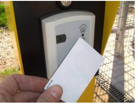
Unmanned and fully automated storage facilities at Dutch railway stations - NS Fiets