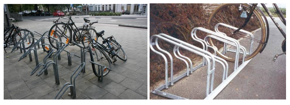
Horizontal front-wheel grips are TO BE AVOIDED

For the same reasons, low front-wheel grips should be avoided . These can be slots in concrete, or wheel grips attached to a wall or incorporated in racks. They do not give enough stability, so that bicycles may fall over and be damaged, also on purpose by vandals. They also do not allow the frame to be secured. Finally, racks attract leaves and litter and need more maintenance. However, in Denmark, front-wheel wedge-shaped grips are widely used and recommended, on condition that the grips are sufficiently wide and mounted at the same height as the wheel. But they still have the disadvantage that the frame cannot be secured, so they are not recommended where theft is a major concern.