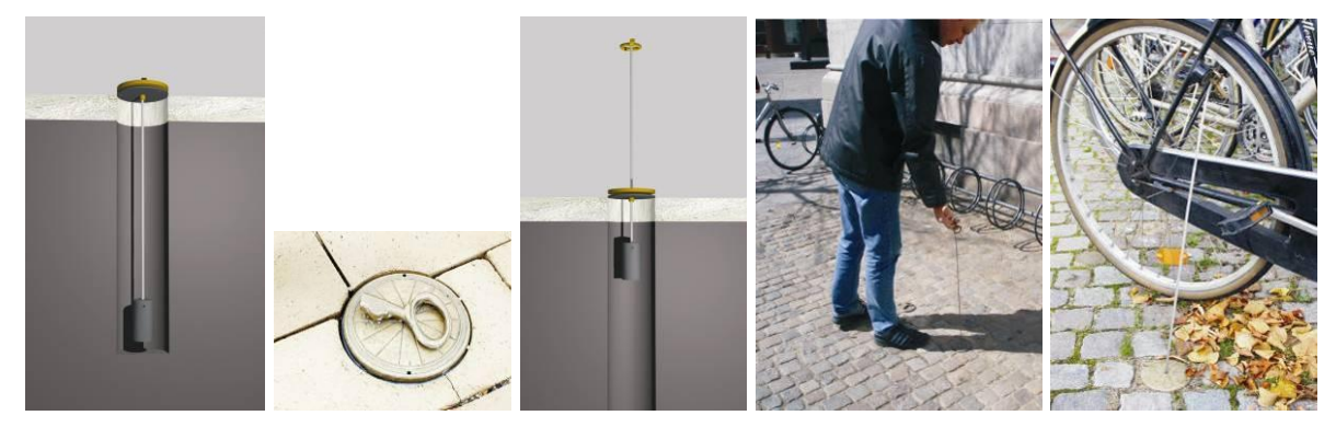
The Odense bicycle key

A creative example is the bicycle key developed in Odense. This is an elegant locking device than is sunk into the ground when not used. The cyclist pulls up an eyelet that can be attached to the bicycle's lock. The eyelet is attaché to a wire and a weight that pulls it down when released. The advantage is that it takes up no space and can be used with all kinds of bikes. The disadvantage is that it does not support the bicycle: in Odense it complements a front-wheel bicycle rack.