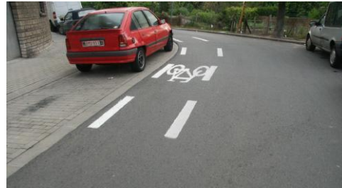
Advisory cycle lane to alert motorists of contra-flow cycling in a road bend, Brussels, BE (D. Dufour)