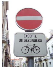
Contra-flow cycling exit sign, Brussels, BE