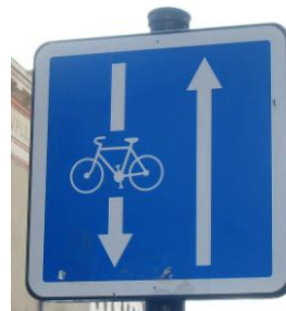
Contra-flow cycling entry sign, Rennes, FR