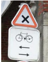
Contra-flow cycling alert sign on side road, Brussels, BE (D. Dufour)