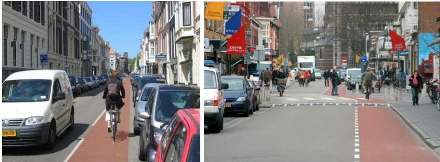
Contra-flow cycling with advisory lane or cycle lane, in narrow and wide one-way streets